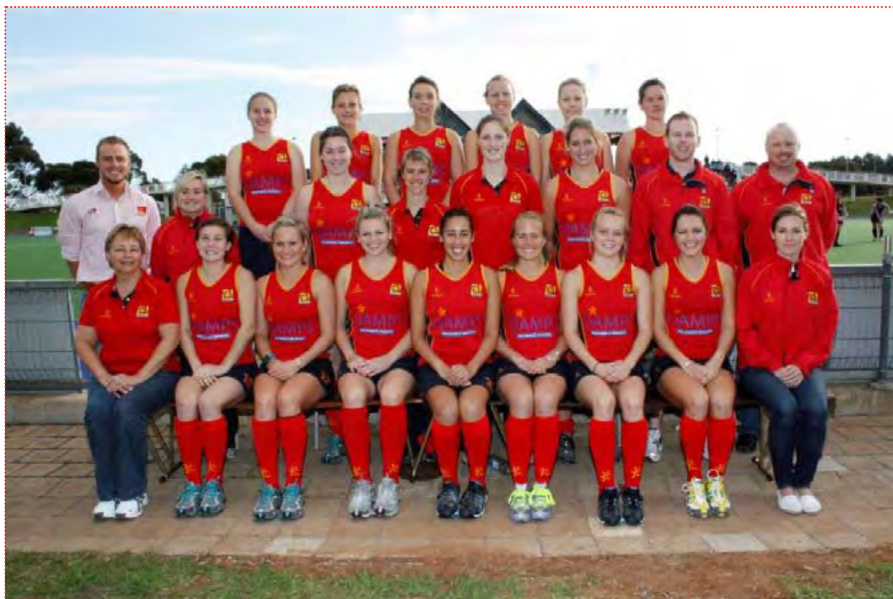
AHL SOUTHERN SUNS