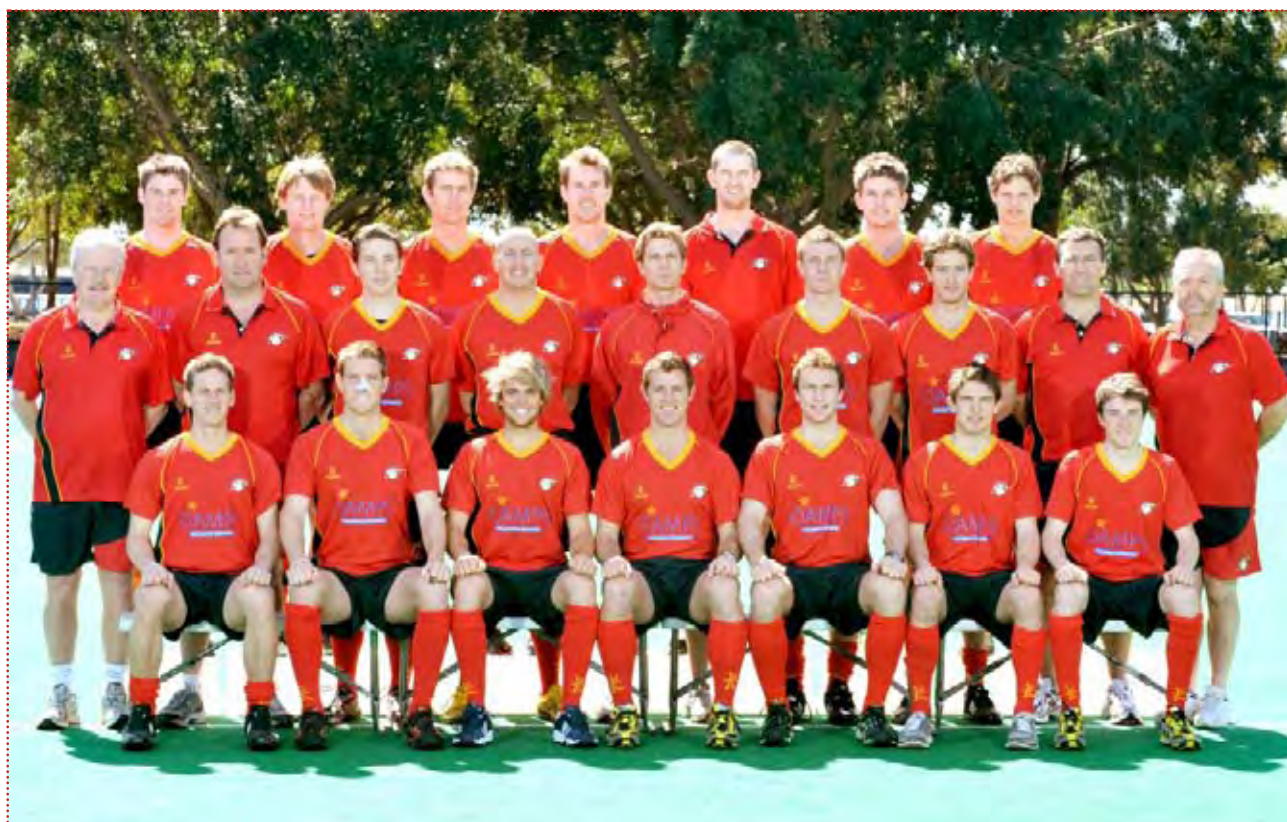
AHL SOUTHERN HOTSHOTS