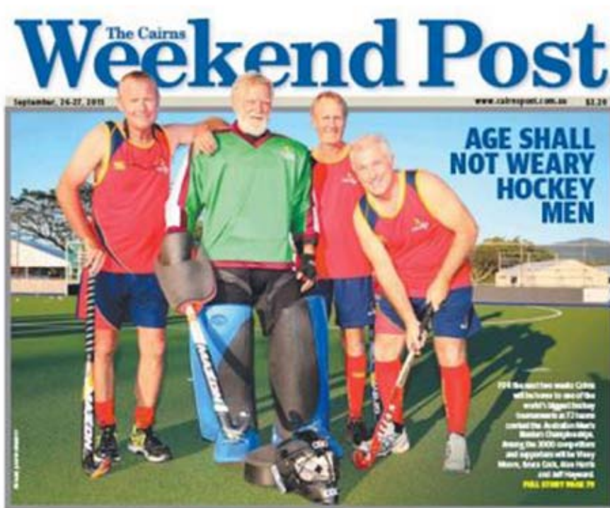
SA Men's Masters feature in The Cairns Weekend Post

run and organised tournament. The Over 50s played off for the final and were our most successful team obtaining a silver medal. The Over 55s and 60s enjoyed their games but were not so competitive while the Over 65s finishing fifth.