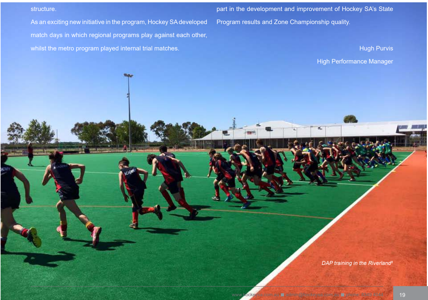
DAP training in the Riverland 8