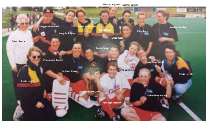
Diet Coke Suns in 1995 o

Thank you to everyone who helped put this special day together and to all the 'Suns' who travelled near and far.