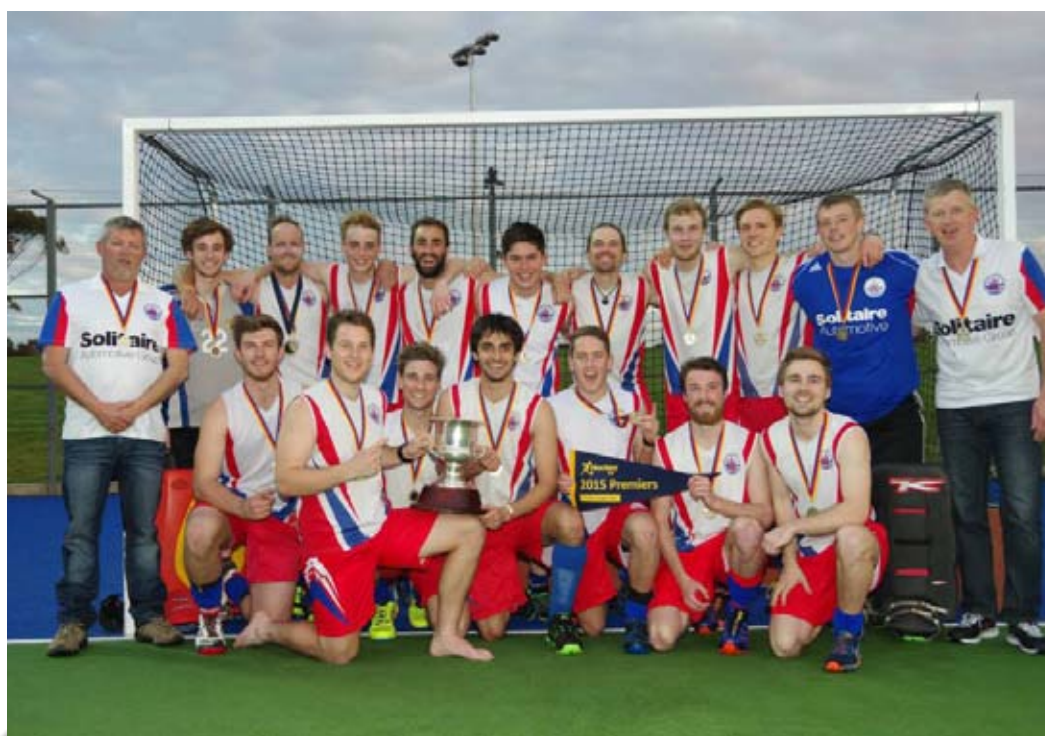
Adelaide Premier League Men's team - 2015 Premiers'

This year we fielded 18 junior teams, of those competitions that have finals, there is only one of our U18 teams that