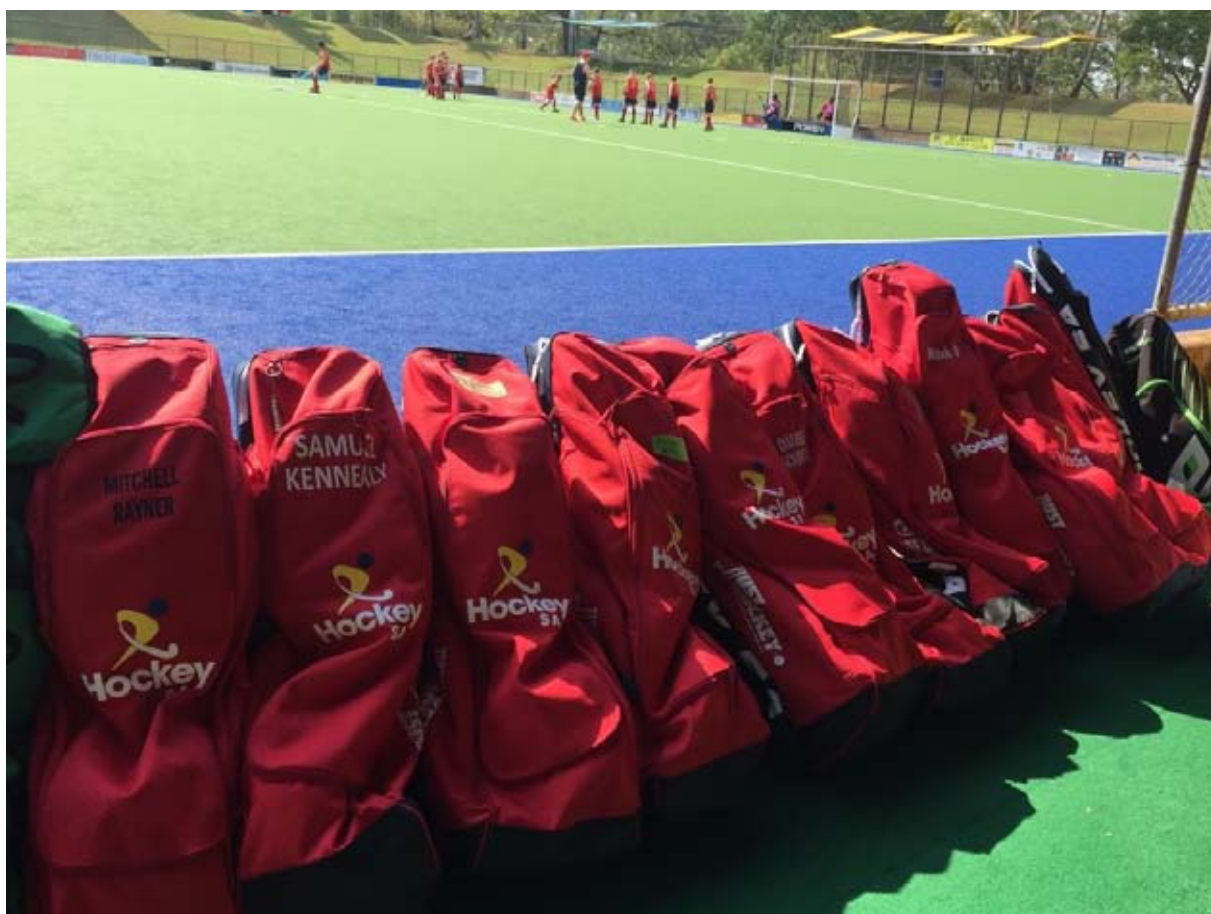
SA Under 13 Boys Stick bags 8

In 2015 Hockey SA were pleased to send five Indoor teams to national championships; an improvement from the two which were sent in 2014.