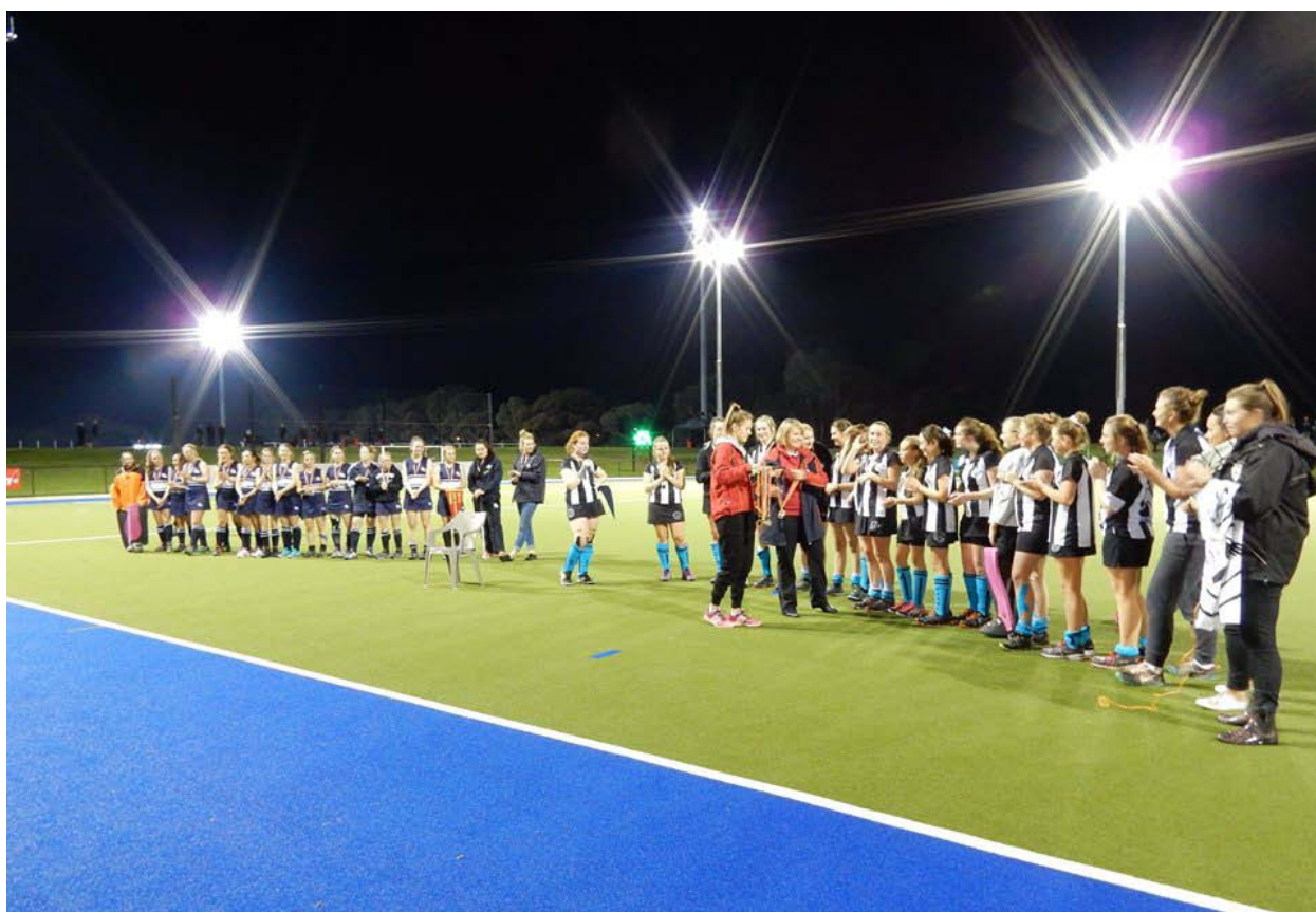
U18 B Women Presentation 9