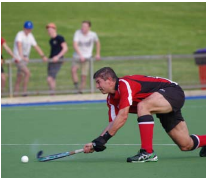
North East Premier League Men 2015'