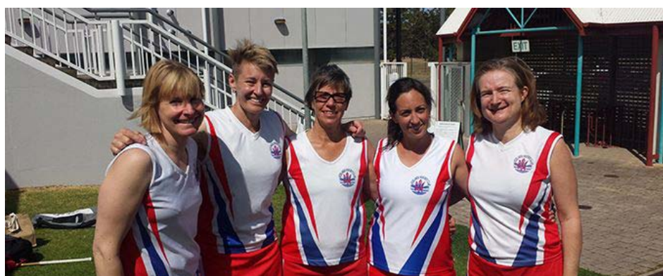
'Adelaidies' during the Australian Masters Games'