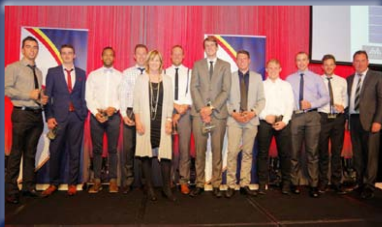
Premier League Men's Team of the Year