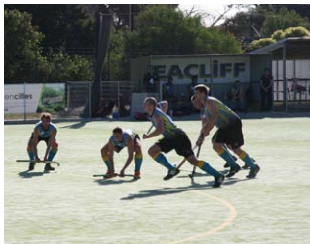
Seacliff Premier League Men 3