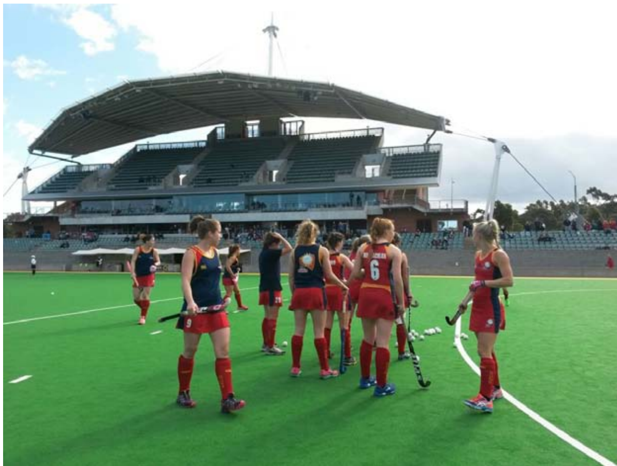
SA Suns ®