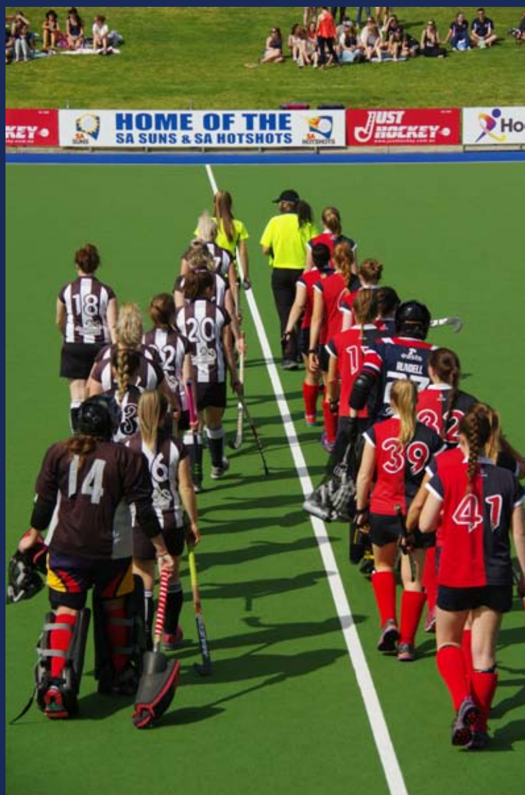
2015 Premier League Women's Grand Finalists - Burnside v Port Adelaide 1

Adelaide Hockey Club Adelaide Hills Hockey Club Adelaide University Hockey Club Annesley Old Scholars Hockey Club Blackwood Hockey Club Burnside Hockey Club Enfield Hockey Club Hockey Supporters SA Inc. Flinders University Hockey Club Forestville Hockey Club Grange Royals Hockey Club North East Hockey Club Port Adelaide District Hockey Club Prince Alfred Collegians' Hockey Club Pulteney Old Scholars Hockey Club St Peters Old Collegians' Hockey Club Seacliff Hockey Club Veterans Club of South Australia PGC/Seymour College OCA Hockey Club UniSA Lions Hockey Club Westminster Hockey Club Woodville Hockey Club Yorkes Hockey Club