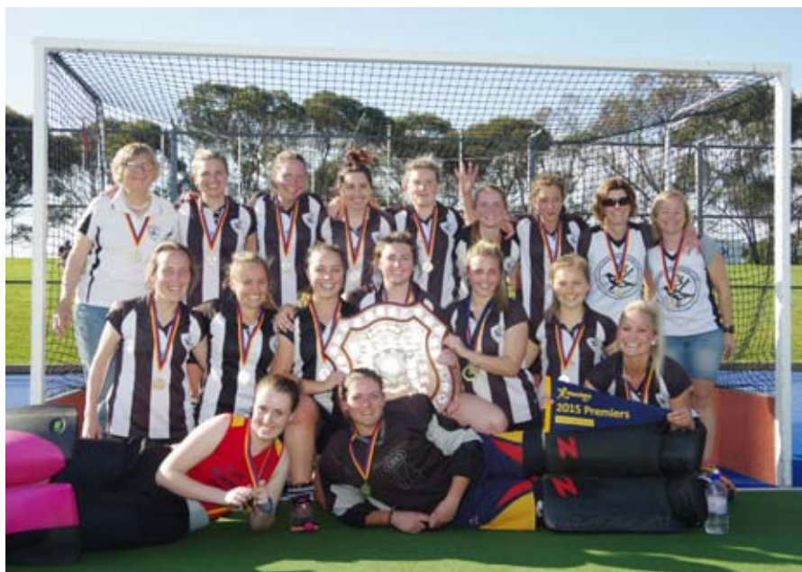
Port Adelaide District Premier League Women's historic 'fourpeat' - 2015 Premiers'

Season 2016 will see the Club continue to build upon its strengths both on and off the field. The Club will launch its Junior Academy, targeting promising juniors in the 12-18 age bracket. Coaching and umpire development opportunities will continue to be an essential element within the Club, with the appointment of a Coaching Director and an Umpire Development Coach. The Club is fortunate that amongst its membership it can call upon