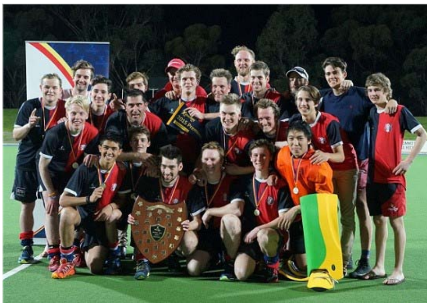
Burnside Metro 1 Men's team - 2015 Premiers 8