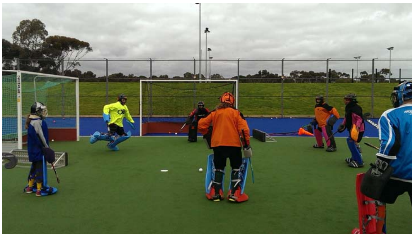
Goalies hard at work mid - drill during the July School Holidays Goal Keeping Clinic 6