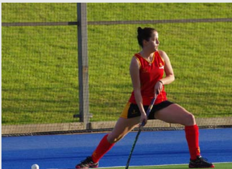
Under 18 SA women 6

None of the current board members have previously been the CEO.