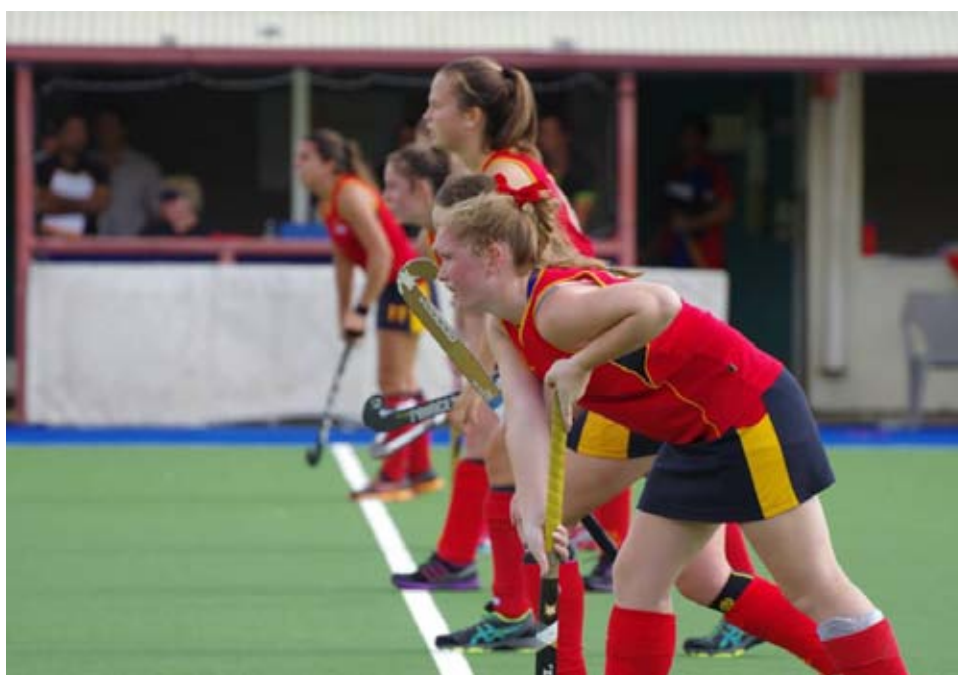
SA Under 18 Women'