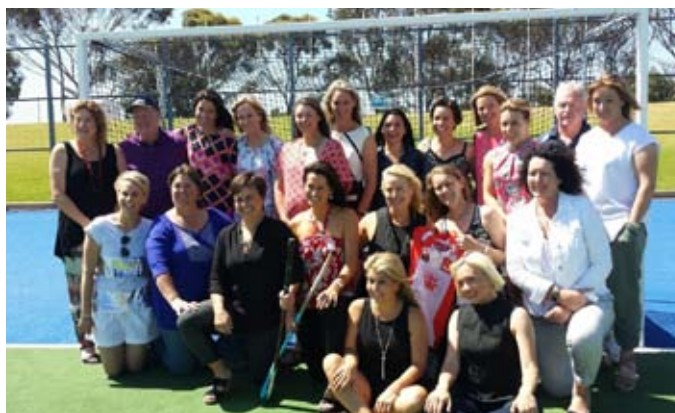
Diet Coke Suns in 2015 o