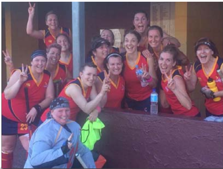
SA Women's Masters O35's