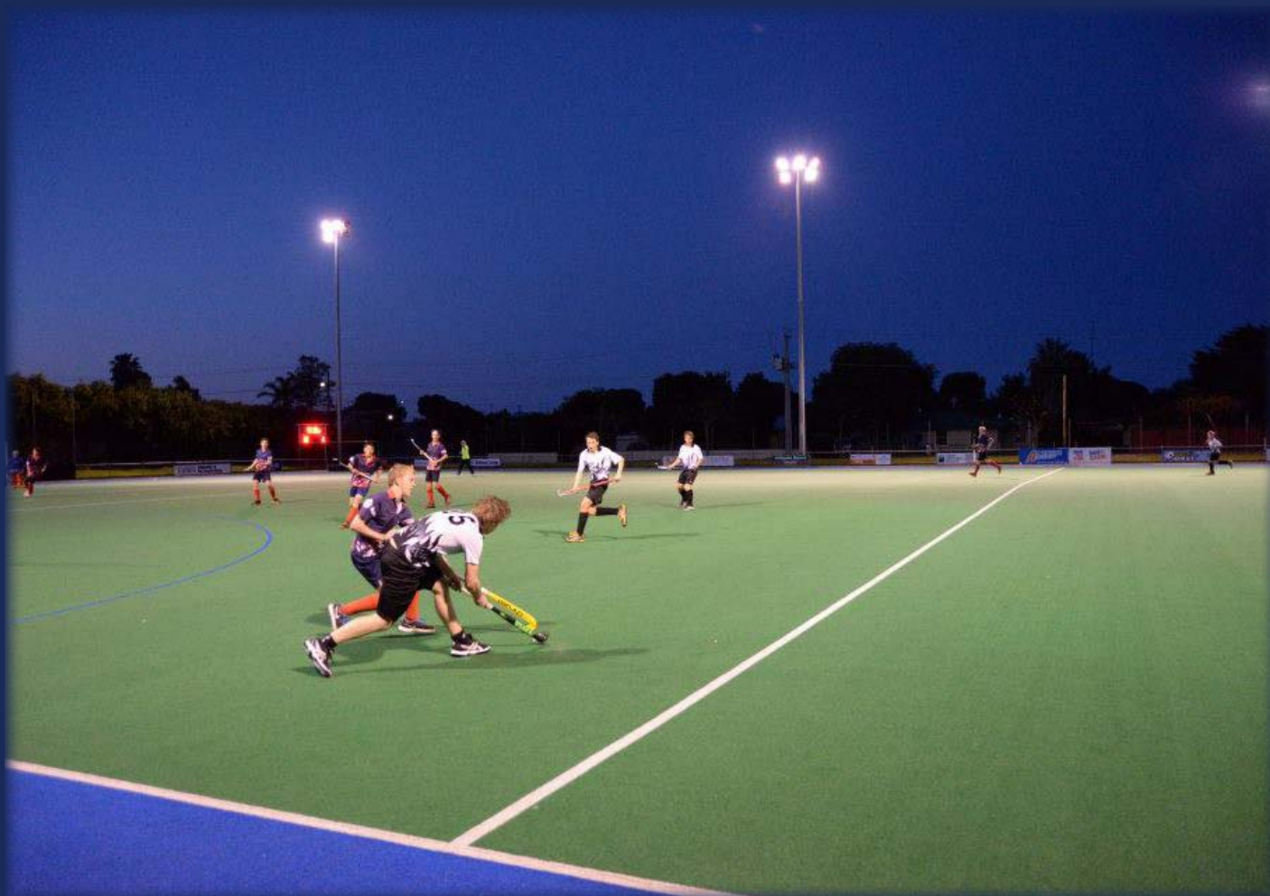
Port Lincoln Hockey Association, located at The Ravendale Sports Complex 2

Port Pirie & Districts Hockey Association Riverland Hockey Association Tatiara Hockey Association Whyalla Hockey Association Yorke Peninsula Hockey Association