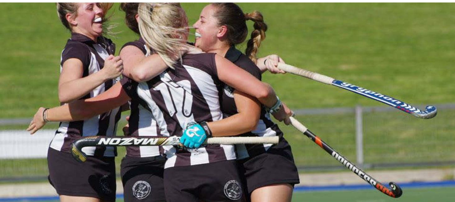
Port Adelaide District Premier League Women Premiers 2015'