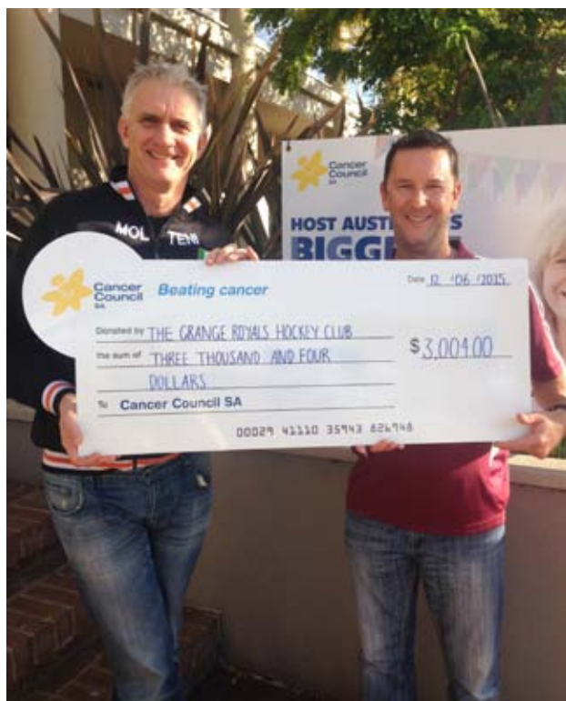
Grange Royals Hockey Club presenting Cancer Council with their fundraising cheque