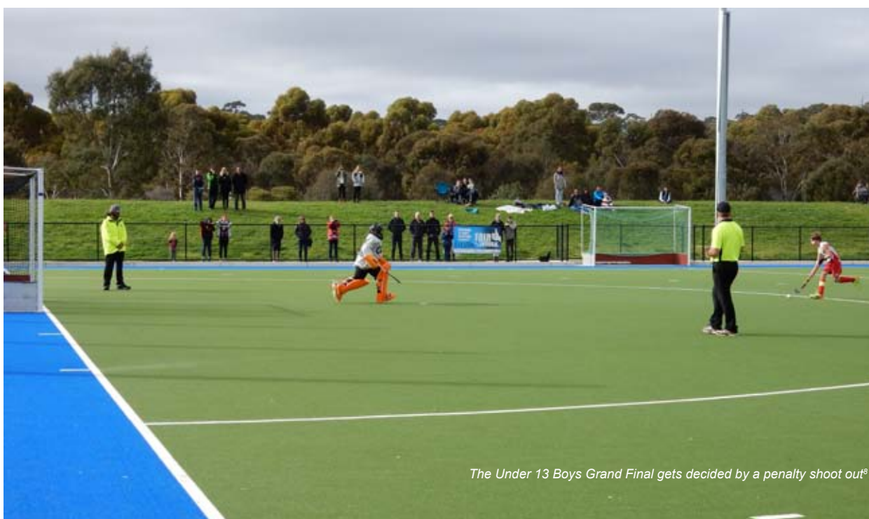
The Under 13 Boys Grand Final gets decided by a penalty shoot out 8

* Player of the Final - Linzi Appleyard (Country West) & Alex Newton (City West)