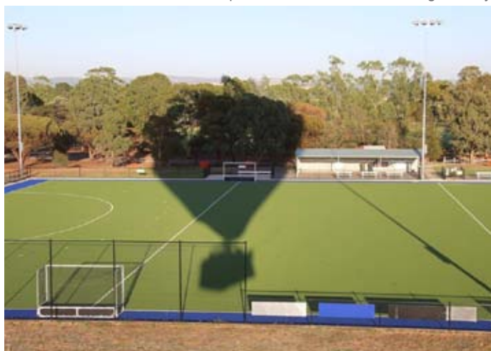
Stockwell Park - Barossa Valley Hockey Association®

The BVHA adopted a revised Constitution and new organisational structure at the end of 2014, in place for 2015. This structure included more sub-committees and coordinators, in addition to the Board. The outcome of this was a spread of the workload amongst many