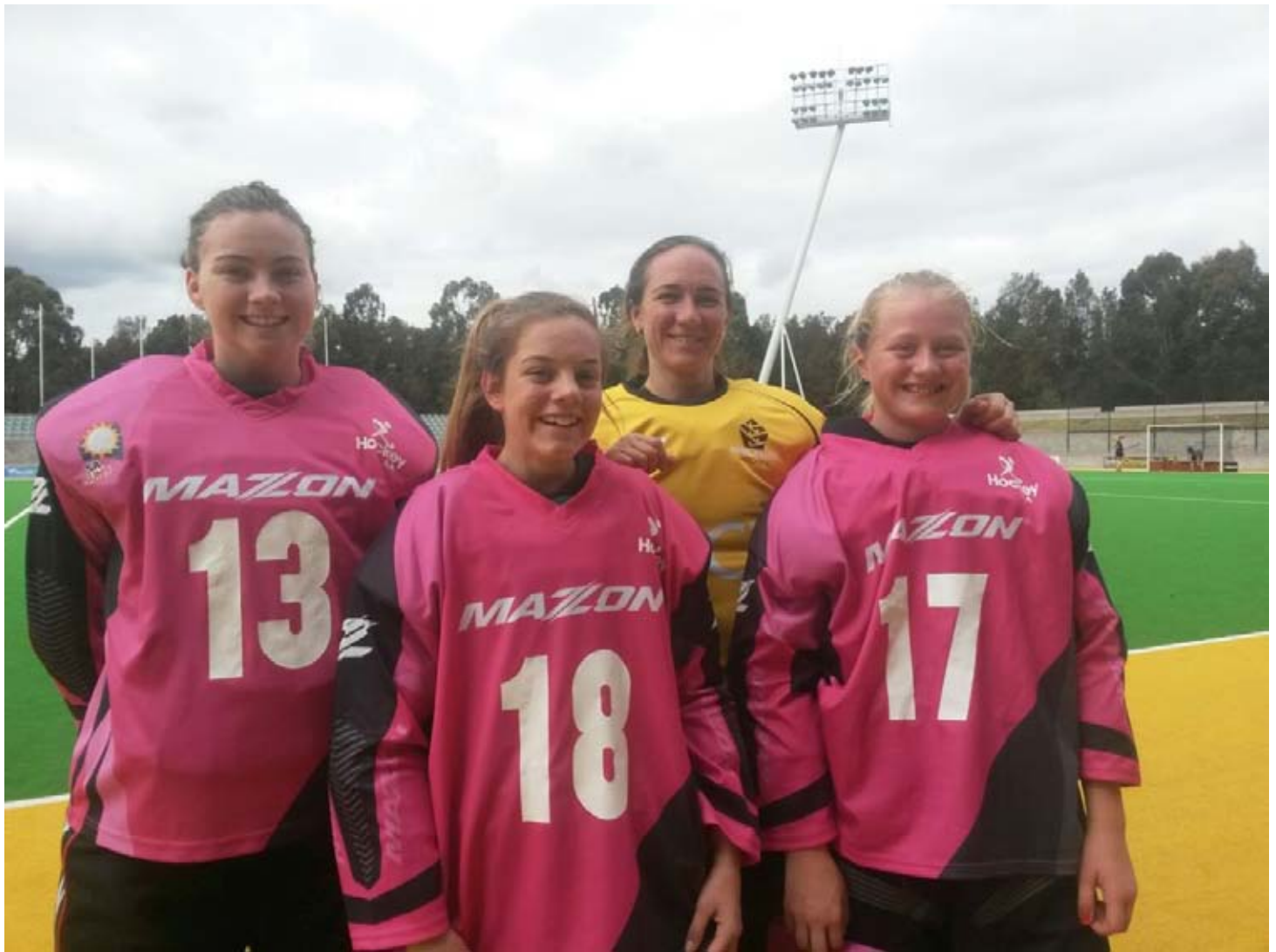
Goal keepers from the SA Suns and Under 13 State Girls team 8

state government and other stakeholders in our sector.