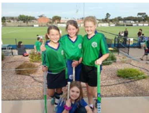
Whyalla Hockey Association Juniors