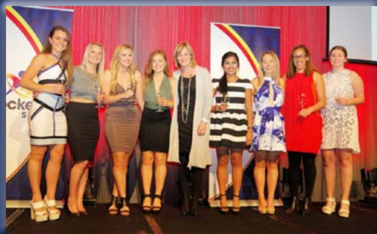
Premier League Women's Team of the Year