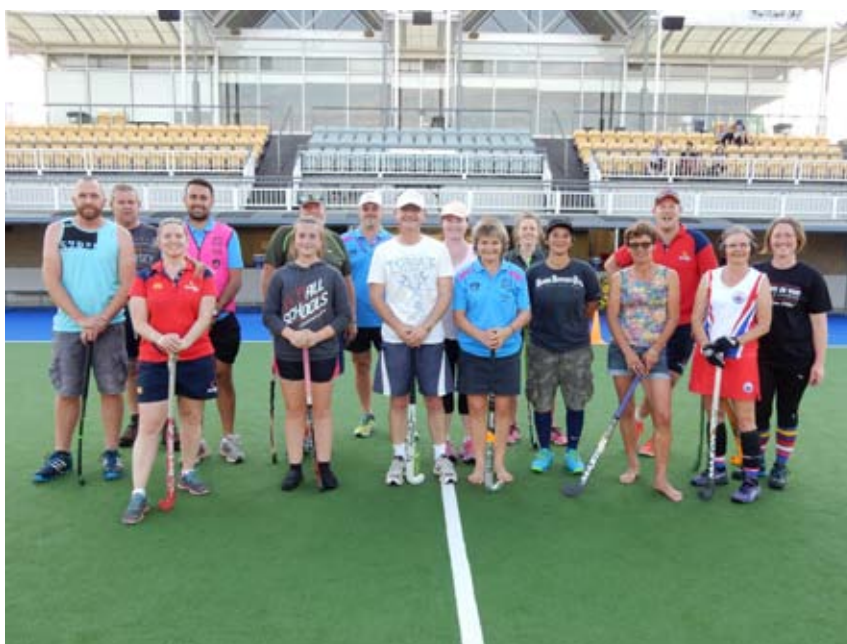
'Masters Come 'n' Try session during the Australian Masters Games'