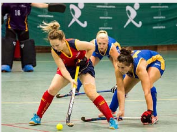
SA's Indoor Open Women 2