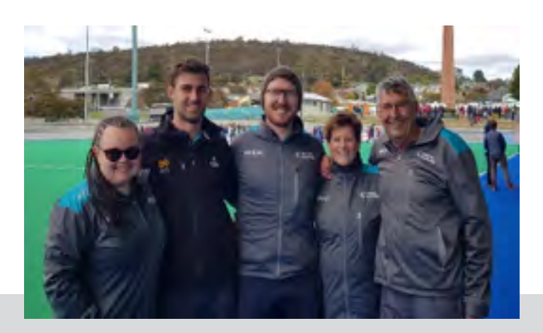
During 2019 I visited several country associations; Tatiara, Barossa Valley and Riverland to present formal umpire training sessions.

The greatest challenge for Hockey SA official development going forward is to boost the numbers of umpires at both senior and Junior level.