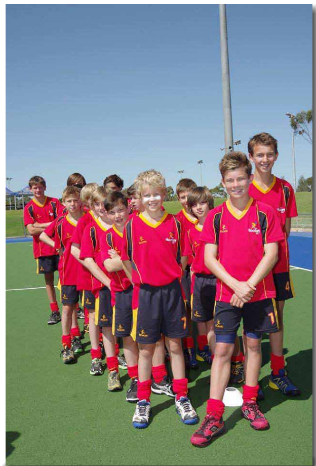
SA State Under 13 Boys