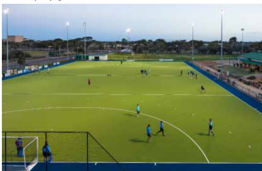
Whyalla Hockey Association new artificial pitch