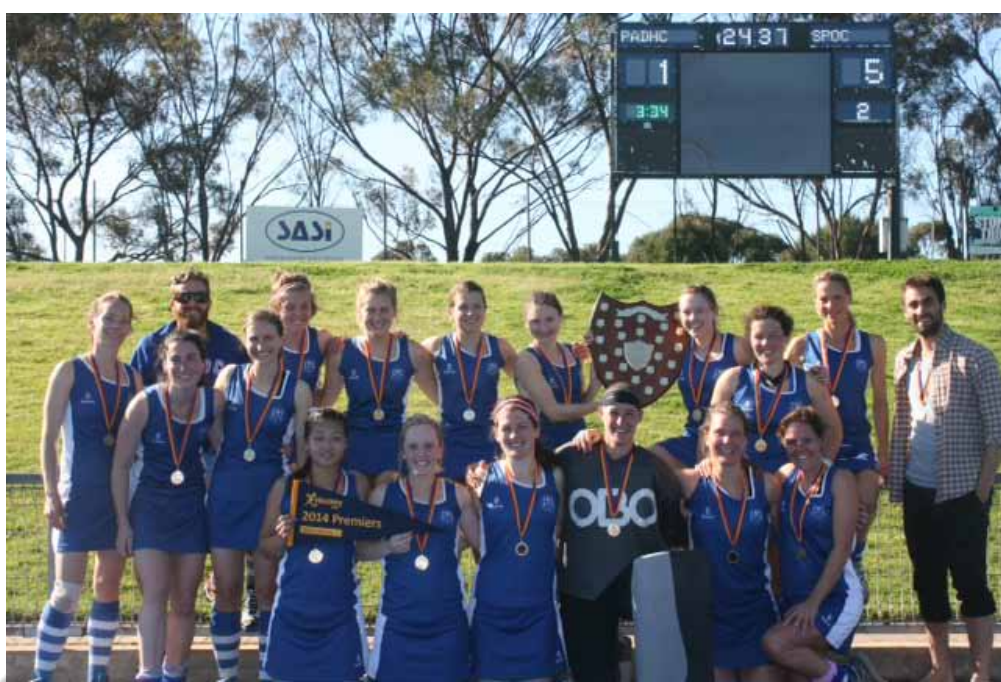
St Peters Old Collegians' Metro 1 Women's team