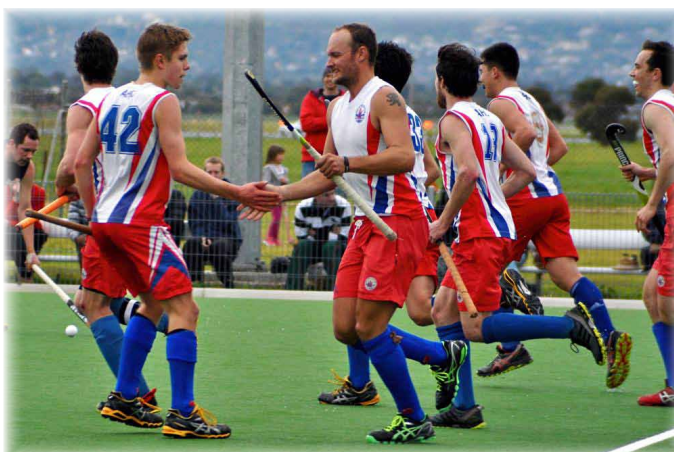
Adelaide Premier League Men