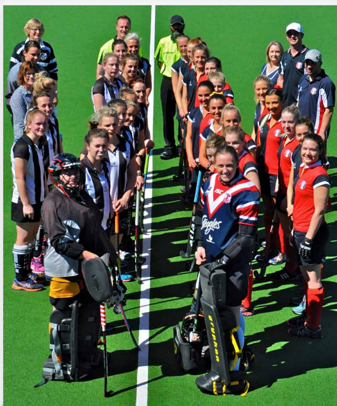
Port Adelaide District & Burnside line up for the Premier League Women's Grand Final

Chair, Metropolitan Competitions Committee