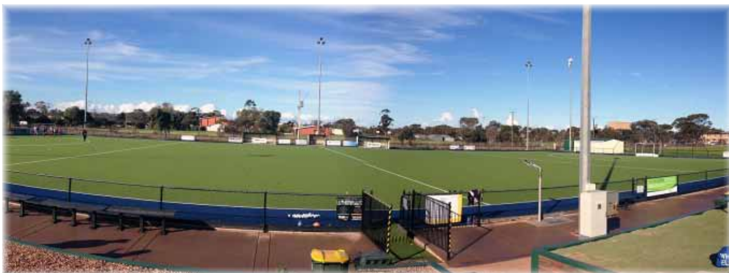
Whyalla Hockey Association located at the Whyalla Hockey and Sporting Community Club