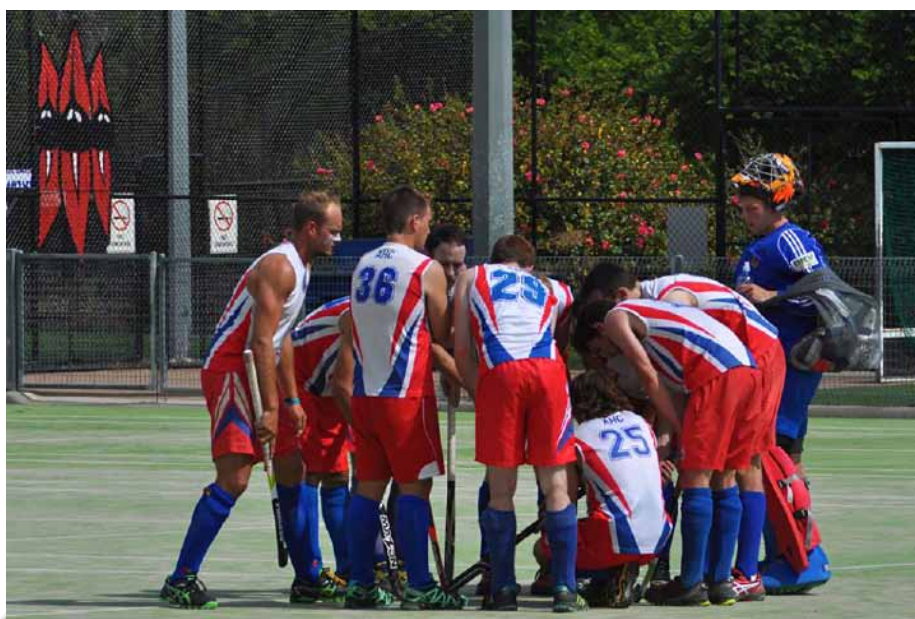
Adelaide Premier League Men's team