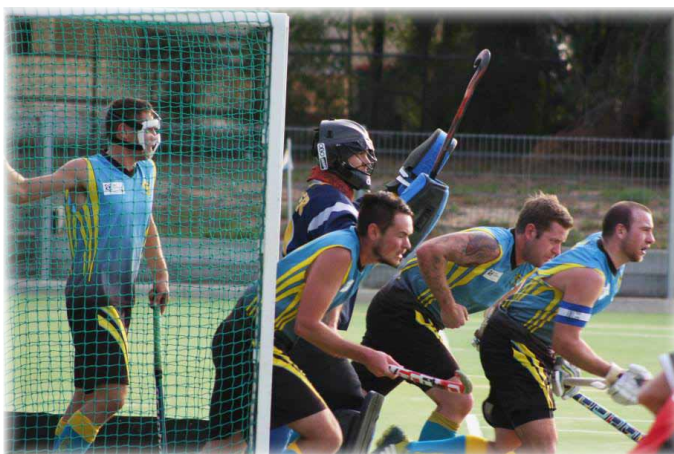
Seaclyff Premier League Men

Adelaide Hockey Club Adelaide Hills Hockey Club Adelaide University Hockey Club Annesley Old Scholars Hockey Club Blackwood Hockey Club Burnside Hockey Club Enfield Hockey Club Hockey Supporters SA Inc. Flinders University Hockey Club Forestville Hockey Club Grange Royals Hockey Club North East Hockey Club Port Adelaide District Hockey Club Prince Alfred Collegians' Hockey Club Pulteney Old Scholars Hockey Club St Peters Old Collegians' Hockey Club Seaclyff Hockey Club The Veterans Club of South Australia PGC/Seymour College OCA Hockey Club UniSA Lions Hockey Club Westminster Hockey Club Woodville Hockey Club Yorkes Hockey Club