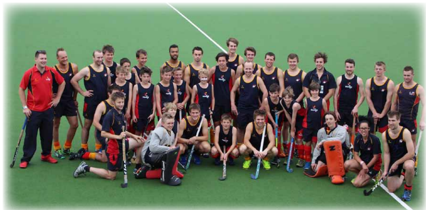
Southern Hotshots and Under 13 SA Boys combined training session

The pairing of the AHL and the U13 National Championships offers a unique chance for young state players to get up close with the state's top senior athletes and show that with hard work and following player pathways, they are only a few short years away from achieving great things on the same team.