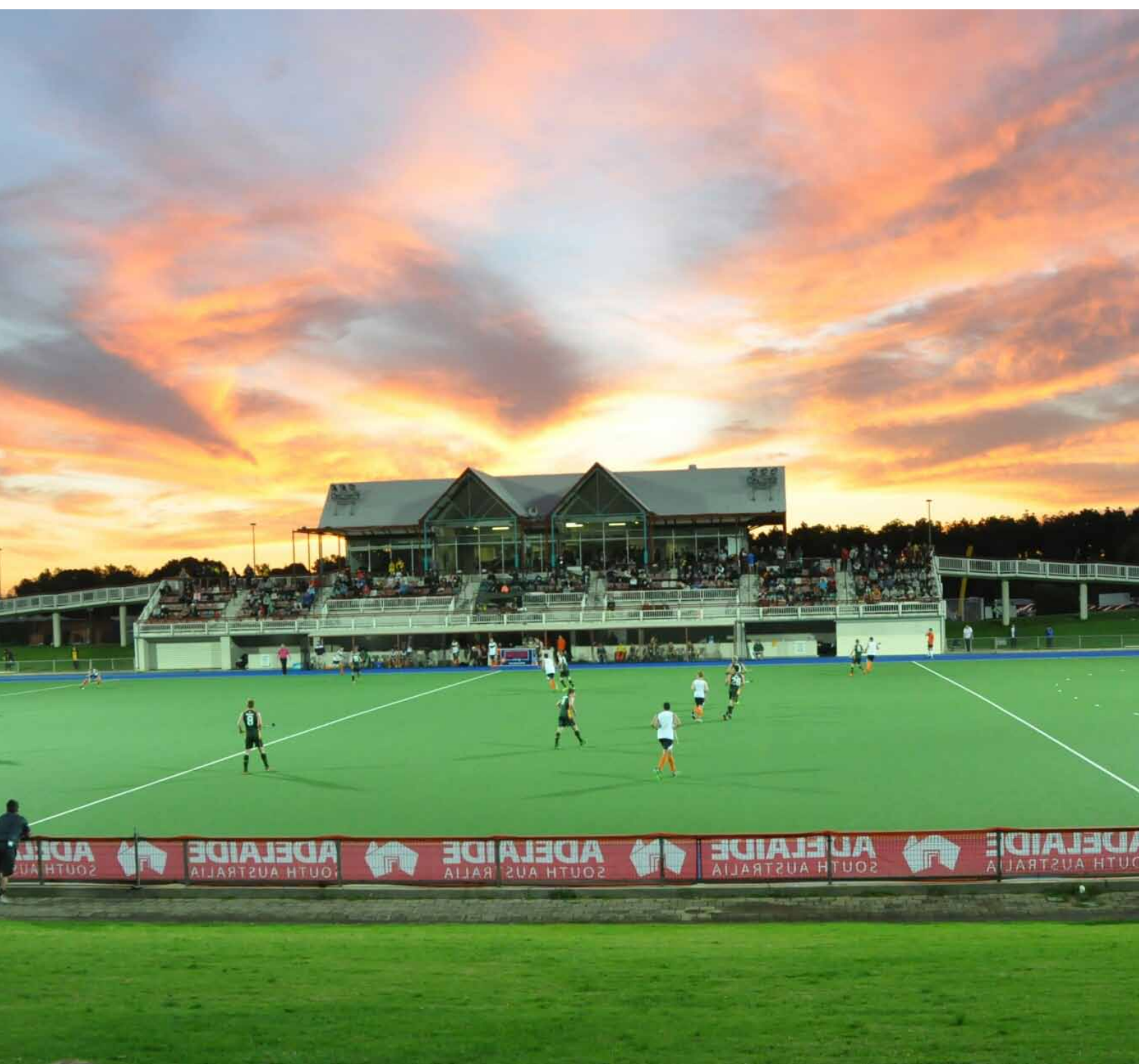
Sunset at the State Hockey Centre during the 2014 Men's AHL