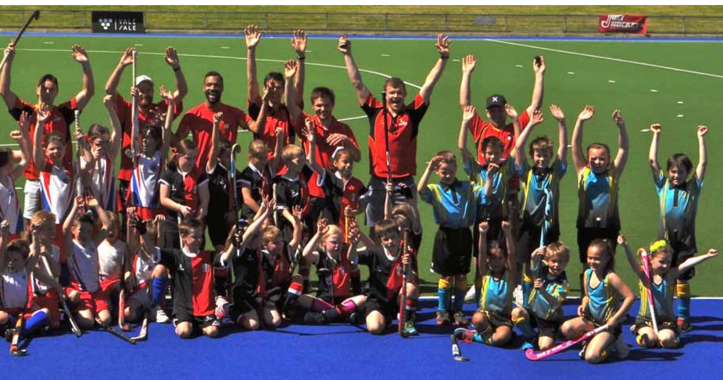
Southern Hotshots and Under 9's after the exhibition game for the 2014 Premier League Grand Finals