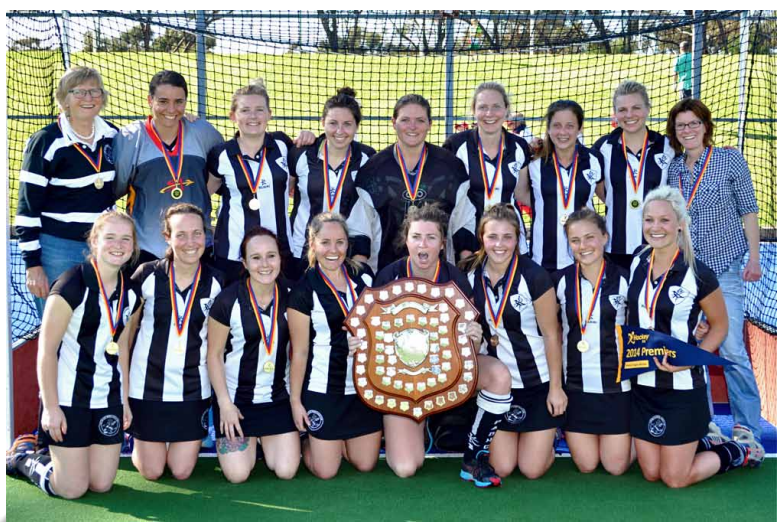
Port Adelaide District Premier League Women's team

Season 2015 will see the Club leveraging off its strengths and continuing to develop junior programs to enhance both participation and skills development. Our elite players will continue to enjoy progressive coaching programs. Equally we will ensure to deliver a great value proposition for our all our