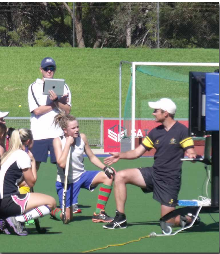
and athletes at the National Women's Forwards & Goalkeeper Camp

Away from individual athlete achievements, there were also notable events that occurred in the past 12 months. These included: