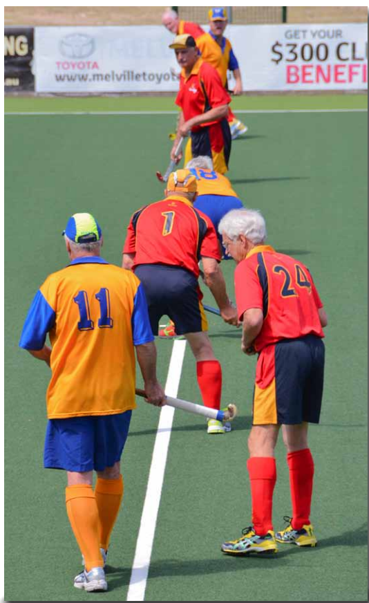
65+ SA Masters Men's team in Perth