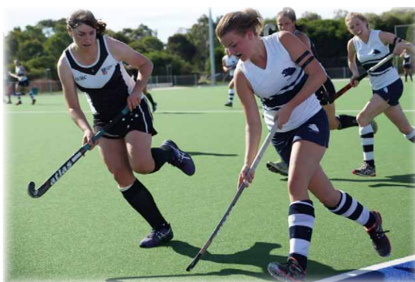
Forestville v Adelaide University Premier League Women