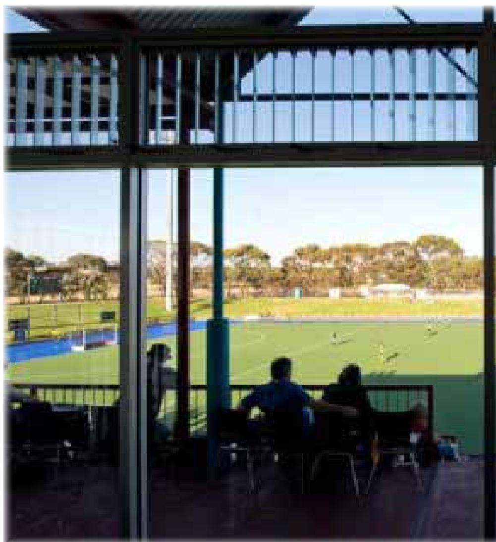
View over Pitch 1 at the State Hockey Centre

Financial performance of the Pines has improved from a $59,801 loss last year to a $34,734 loss this year even whilst there was