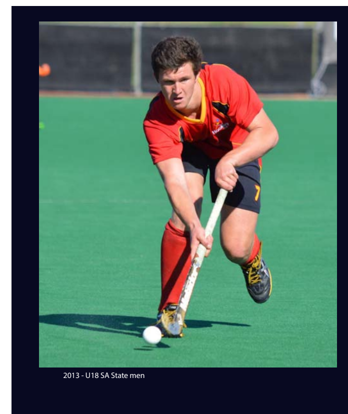
2013 - U18 SA State men

The Association successfully hosted a range of national tournaments during the past twelve months including under 21 women, under 15 men, national primary schools and the university games.