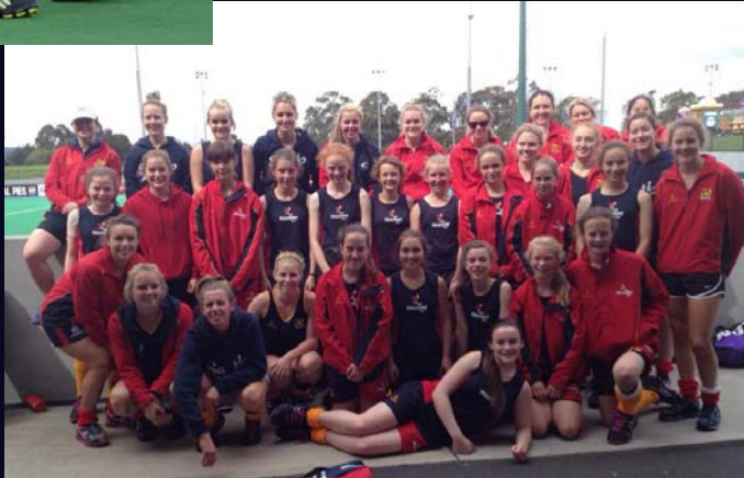
AHL Southern Suns & Under 13 girls