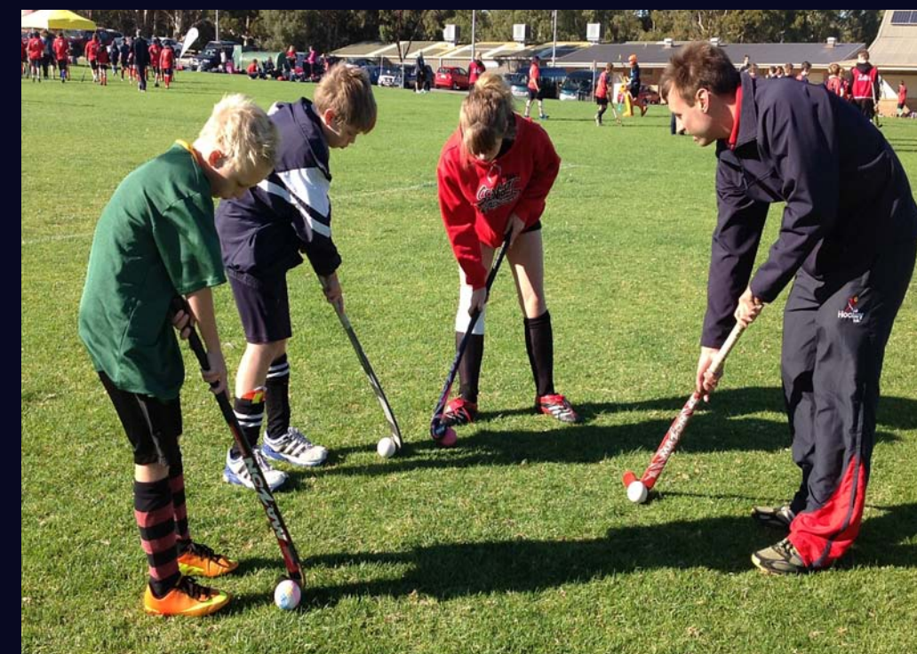
North East SAPSASA Clinic