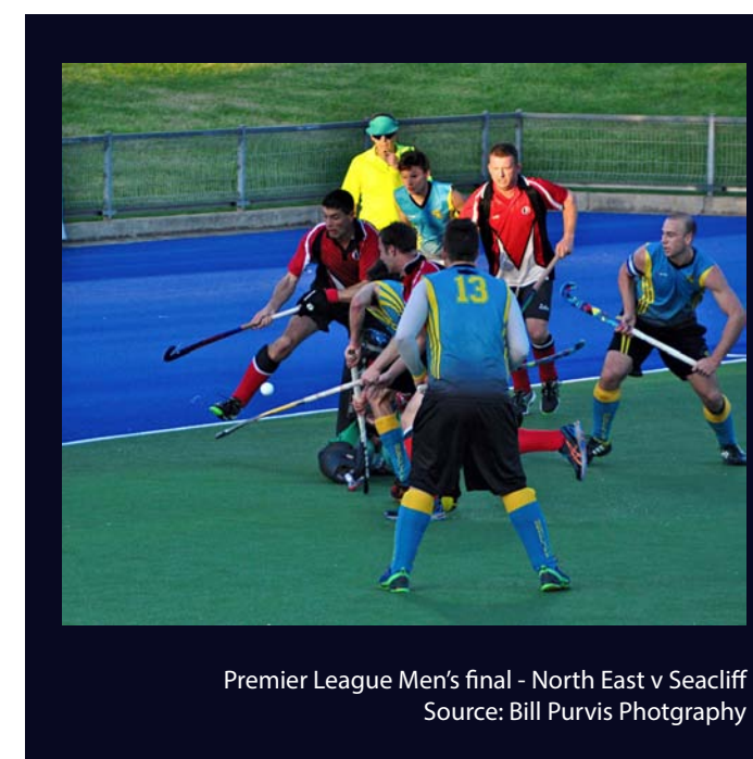
Premier League Men's final - North East v Seacliff