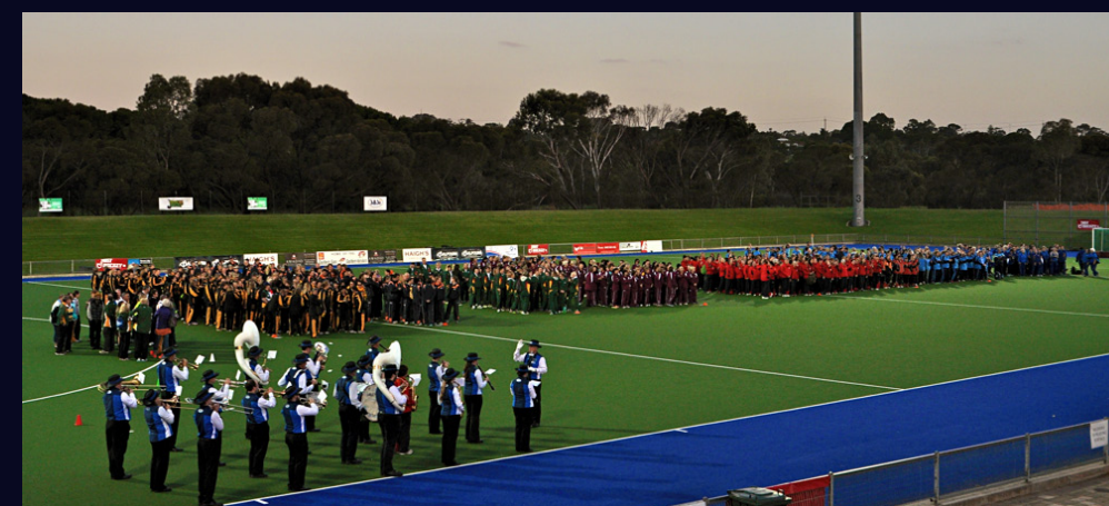
Opening Ceremony

Ten years since Adelaide previously hosted the Australian Women's Masters Championships in 2003, the championships returned to the State Hockey Centre on September 26th, 2013 shortly after the official opening of the new 'second pitch'.