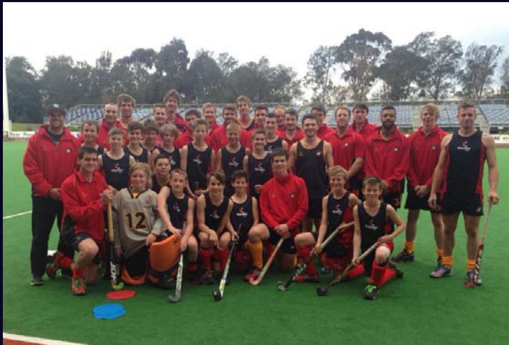
AHL Southern Hotshots & Under 13 boys