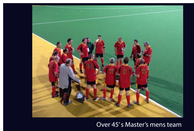
Over 45's Master's mens team