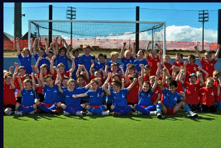
Under 9 boys and girls

The day concluded with Premier League women's and men's finals on pitch one.