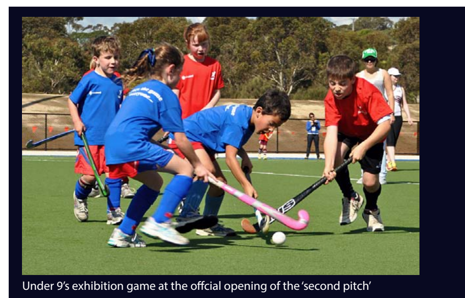
Under 9's exhibition game at the official opening of the 'second pitch'