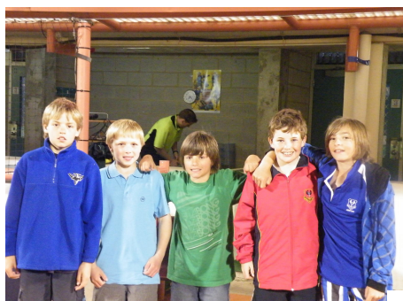
Grand Final Ball Boys