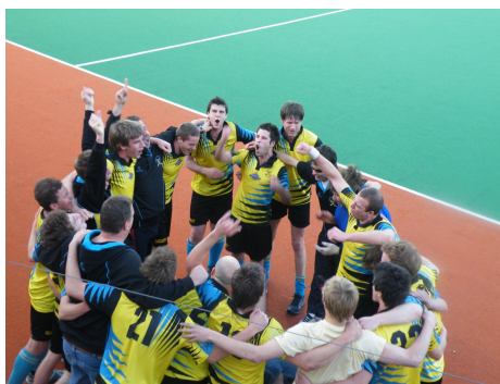
Seacliff PLM Premiers 2008