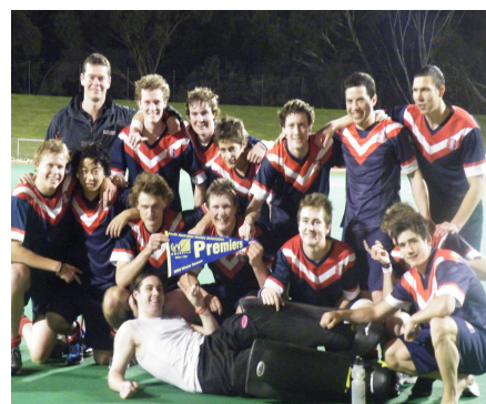
Burnside Metro 1 M Premiers 2008