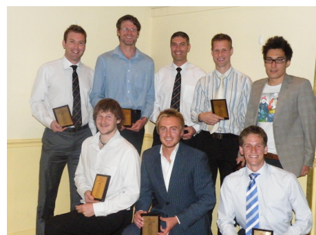
2008 Mens Premier League Team of the Year