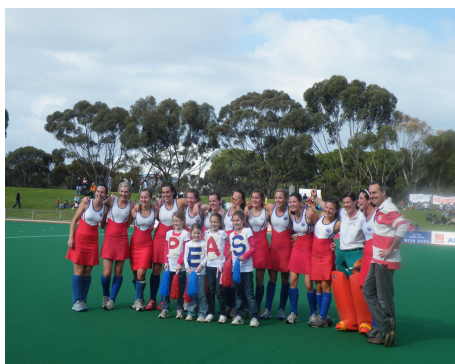
Adelaide PLW Premiers 2008