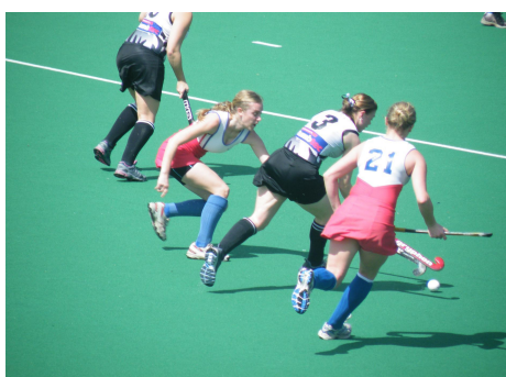
Pt Adelaide Metro1 W Premiers 2008