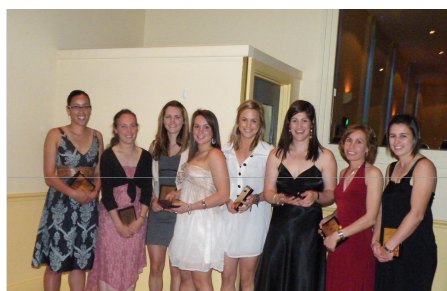
2008 Women's Premier League Team of the Year